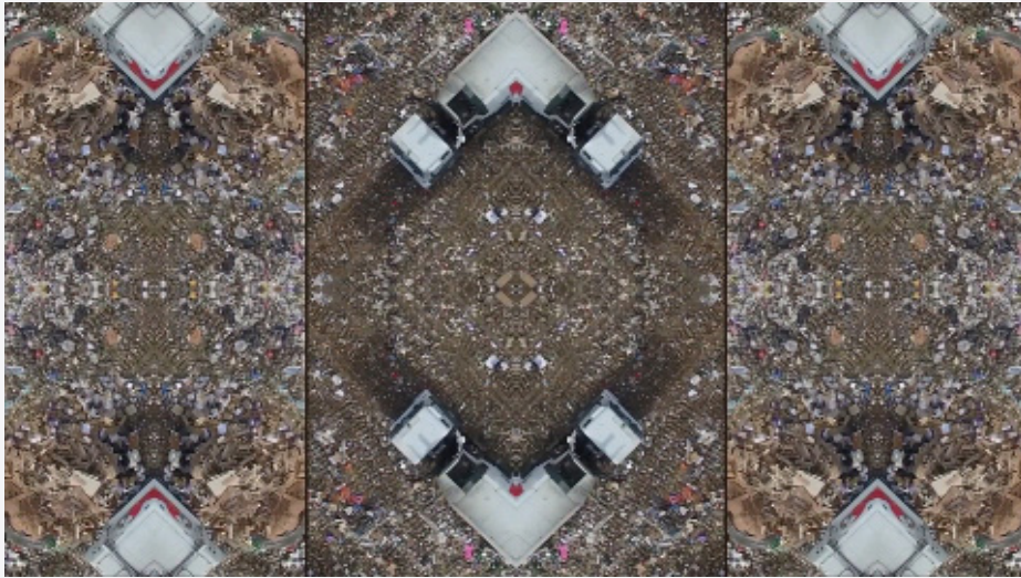
Wadaloada Dreaming 2017 video still

From 2001, following her involvement in the design of Reconciliation Place, Ngambri (Canberra), Casey worked on various public art projects promoting reconciliation and First Peoples' culture – including the ongoing public participation event Let's Shake (2006–2011), initially conceived for reconciliation and later as a gesture towards peace and solidarity.