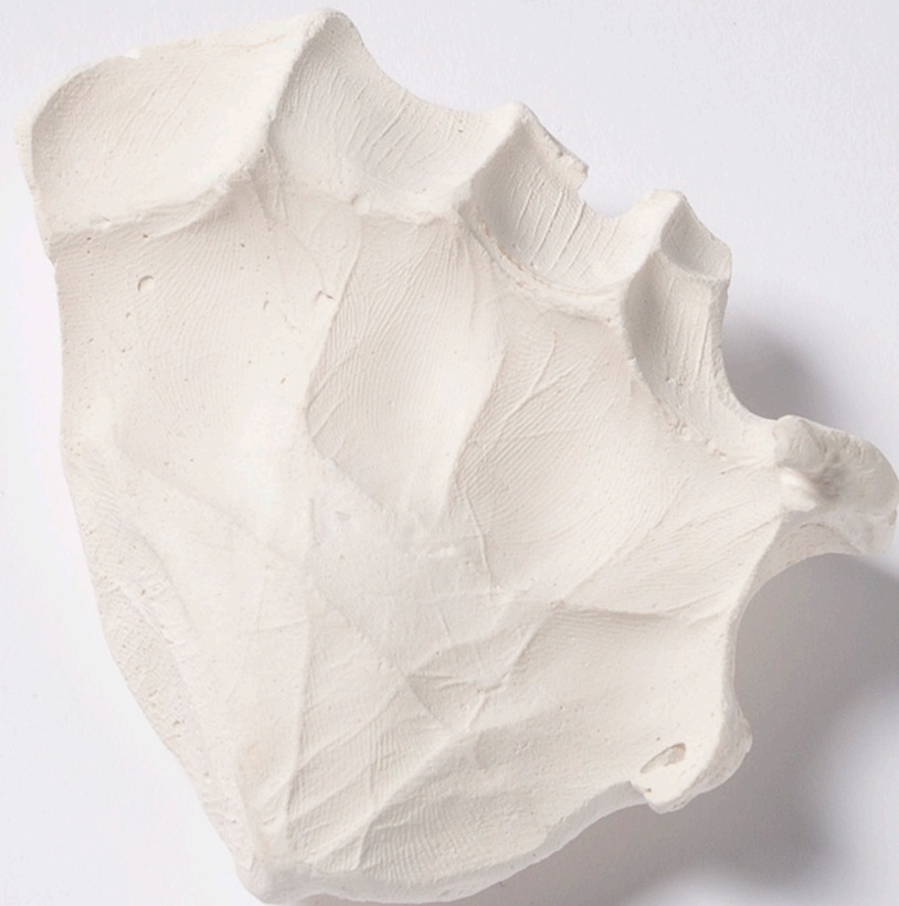
Let's Shake (detail) 2006–2011 plaster