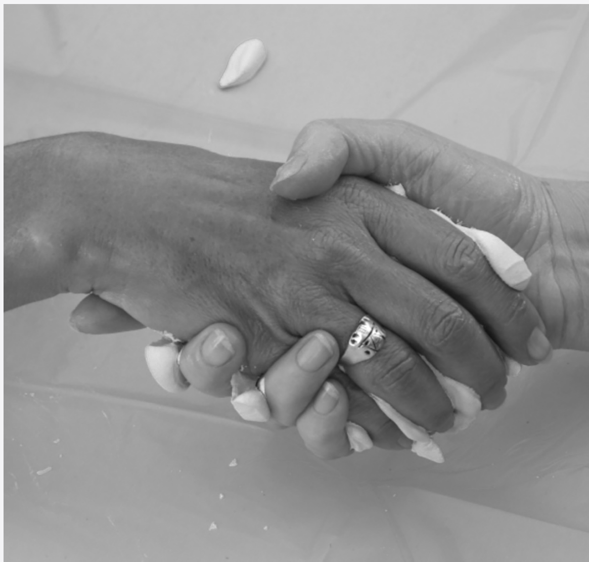
Let's Shake casting event 2006–2011

Presented at KHT for the first time in 2024, Let's Shake is exhibited as a unique installation tracing the perimeter of the gallery, creating an immersive space surrounded by a linear horizon line of over 200 unique plaster casts. This visible horizon line echoes the notion of an intangible space in-between, which Casey made visible by facilitating the creation of each plaster cast. Collectively, the work embodies the memory of human exchange, momentary interaction and the continuing legacy of the artist, who embraced Let's Shake as a platform to advocate for peace, trust and solidarity.