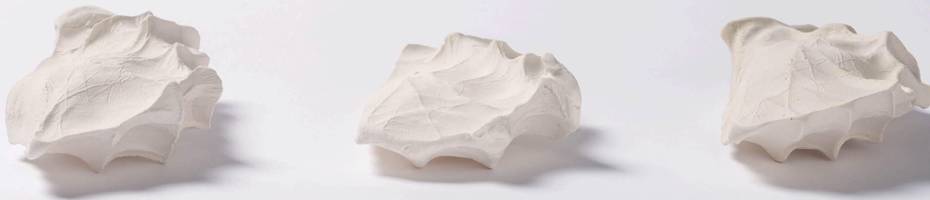
Let's Shake (detail) 2006–2011 plaster