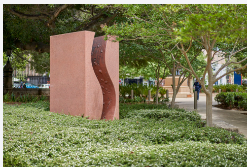
Reconciliation Touchstone 2007 University of Adelaide

In 2008, the work was exhibited under the title Contact/Converse at the Ian Potter Centre, NGV Australia at Fed Square, Narm.