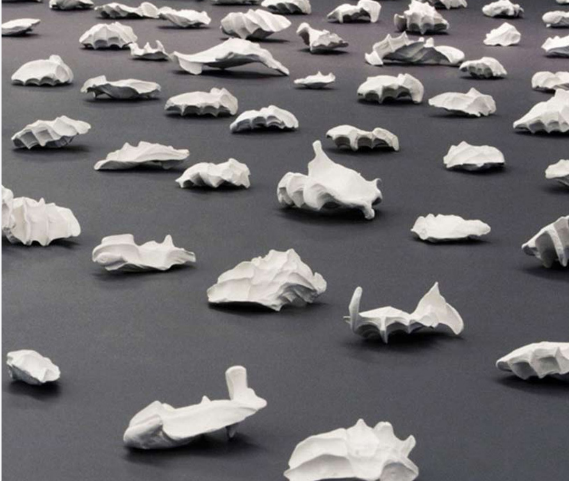
Installation view Contact/Converse 2008 Ian Potter Centre, NGV Australia, Fed Square, Narm