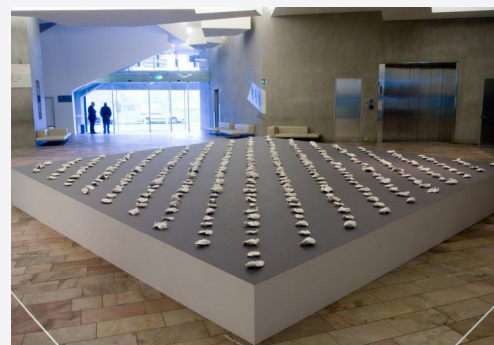
Installation view Contact/Converse 2008 Ian Potter Centre, NGV Australia, Fed Square, Narm