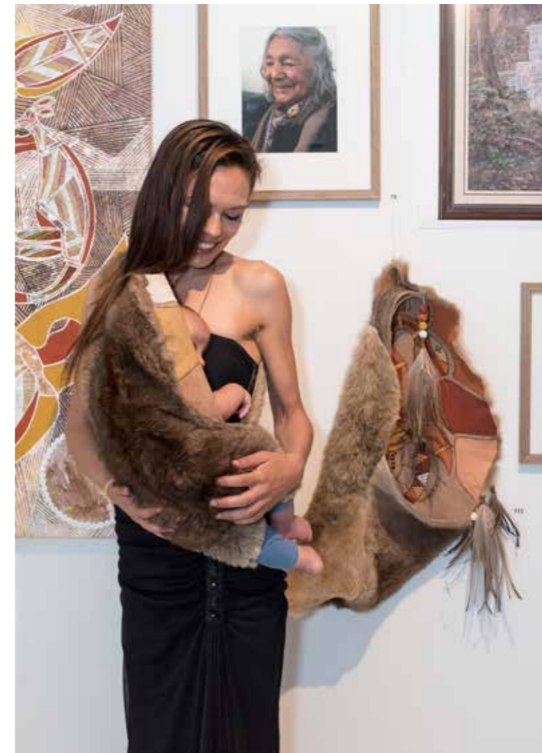
top: Artists and guests at community day launch, Koorie Art Show 2018 bottom: Community day launch, Koorie Art Show 2018

Peta Clancy's Undercurrent exhibition at the Koorie Heritage Trust in Melbourne's Federation Square aims to bring this hidden history to the surface, exploring the frontier wars and massacres that characterised Australia's colonisation into the early 20th century. The Conversation